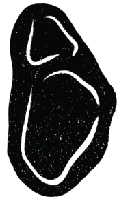
Flat Pinch Large Knob/Hook