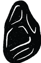
Subtle Pinch Small Knob/Hook