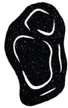
Tough Pinch Small Knob/Hook