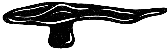
Gentle Pinch Sliding Door Handle