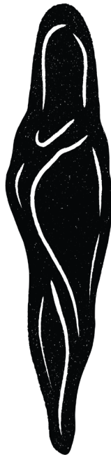
Gentle Pinch Long Knob