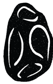
Chunky Pinch Large Knob/Hook