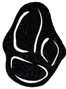
Firm Pinch Large Knob/Hook