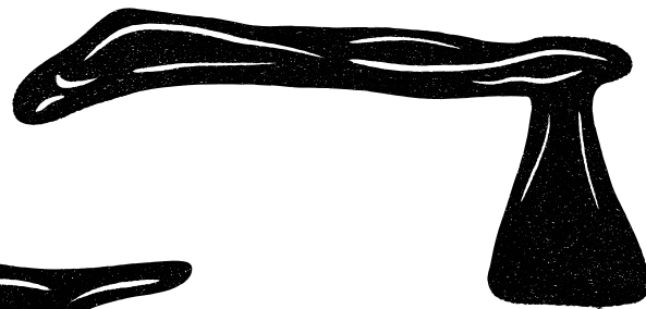
Tender Pinch Door Lever